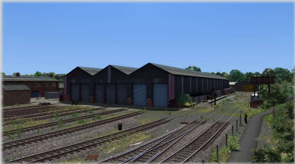
The Matthew Kirtley Museum