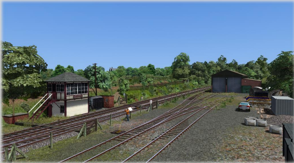
Butterley Yard and DMU Shed