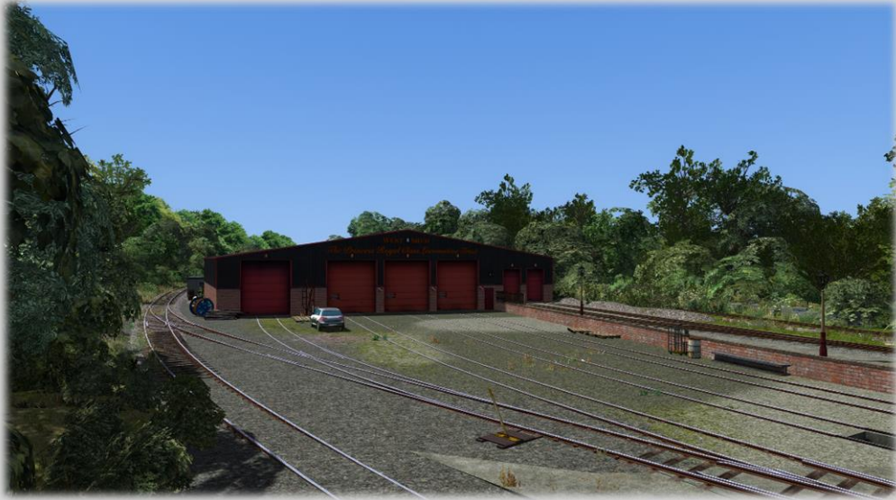
The Princess Royal Class Locomotive Trust West Shed