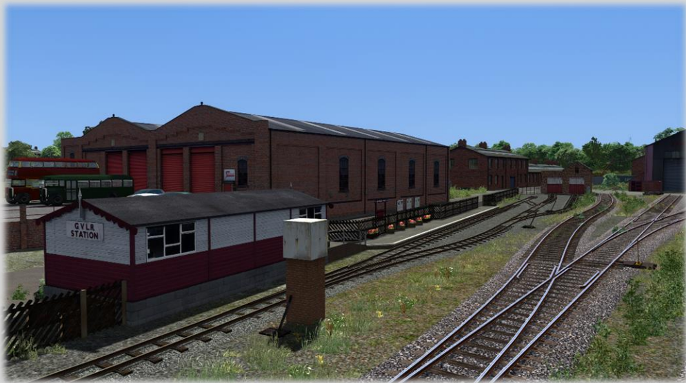
The Golden Valley Light Railway