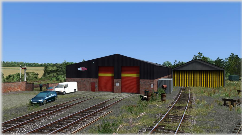
Swanwick Diesel Depot