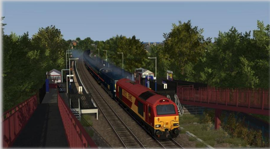
East Garforth Station