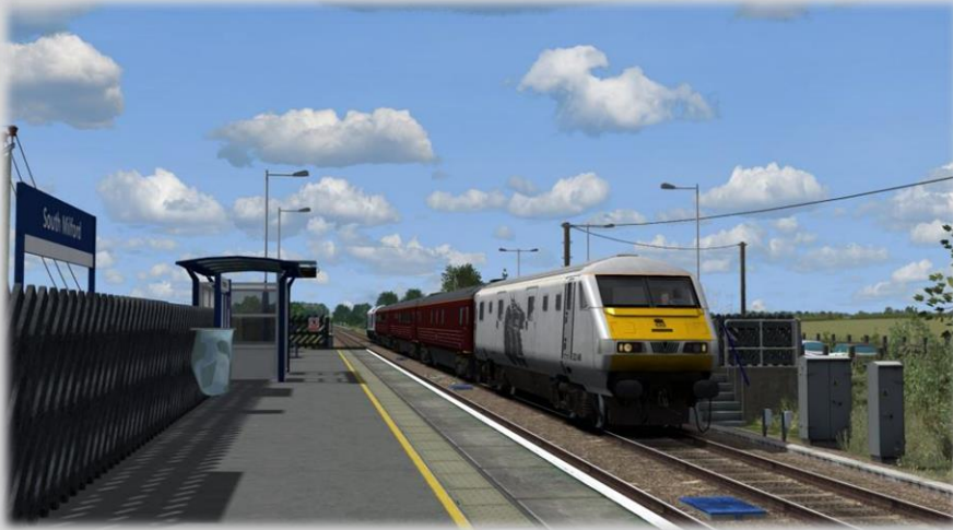
South Milford Station