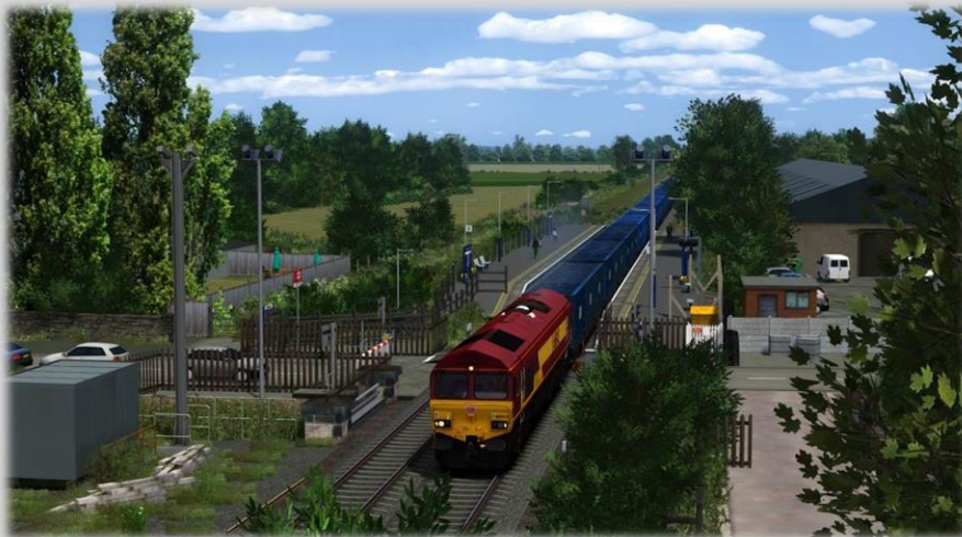
Sherbern in Elmet