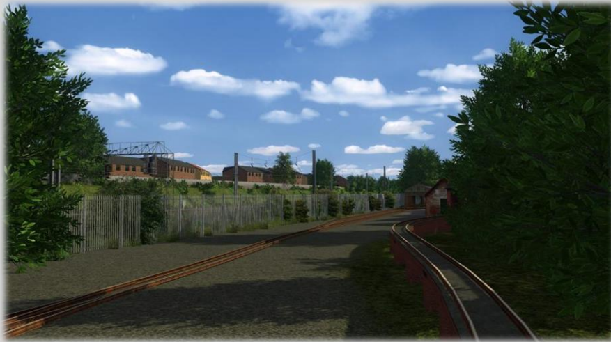
York Small Model Engineers Club