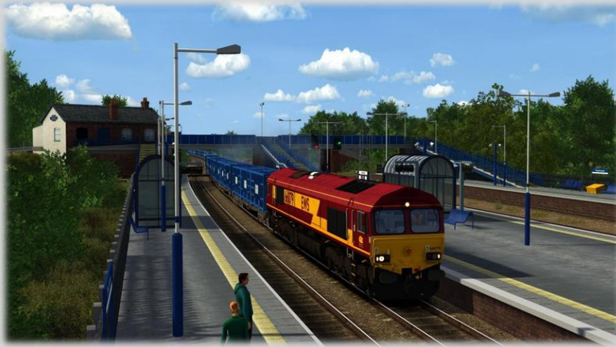
Church Fenton Station