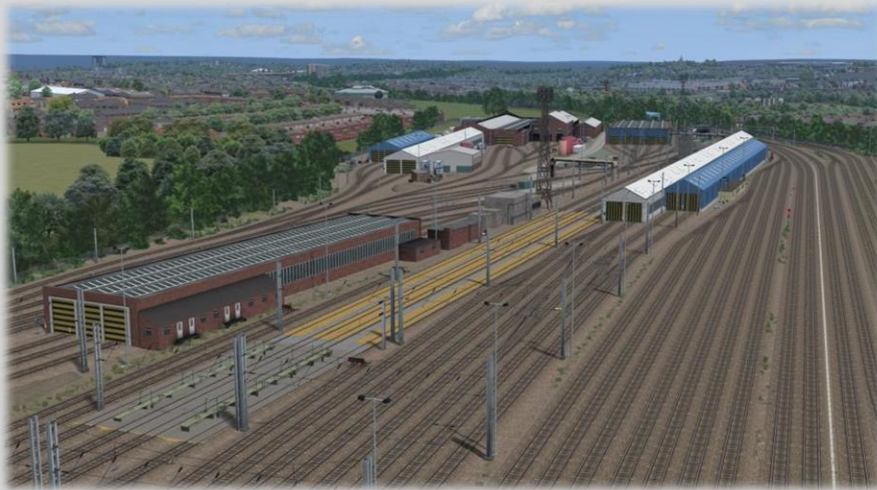
Neville Hill Depot