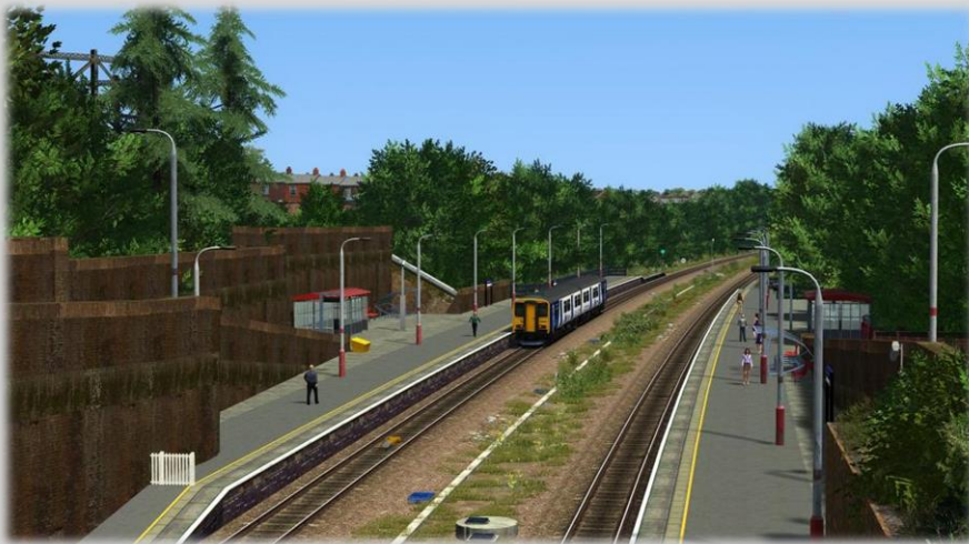
Cross Gates Station