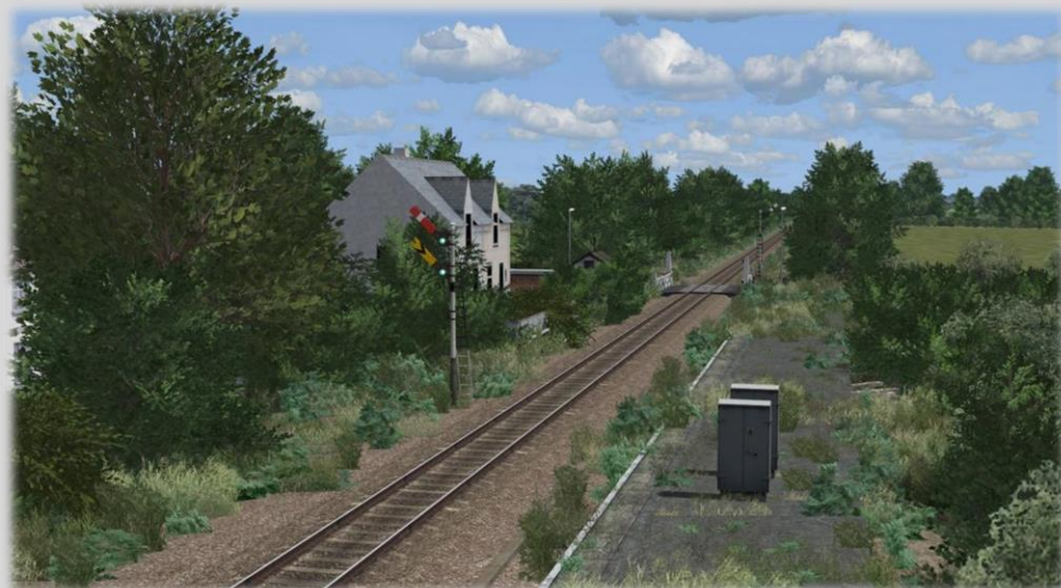
Between Poppleton and Hammerton